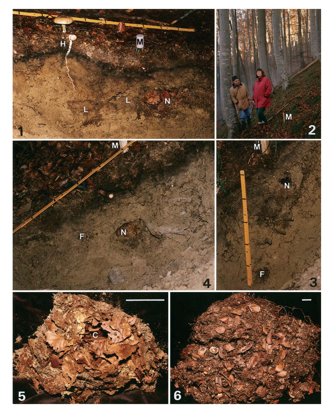
Figs. 1–6. Hebeloma radicosum and wood-mouse nests in Switzerland. 1 Case 1. Soil profile showing H. radicosum ( H ) fruiting on the mouse latrine ( L ) near the mouse nest ( N ). The film container ( M ) marks the previous fruiting on October 12, 1997. The thick lines on the folding scale are at 10-cm intervals; the same scale is seen in 3 and 4. Photograph on November 21, 1997. 2, 3 Case 2. 2 Point of H. radicosum fruiting ( M ) and the beech forest as a habitat of the fungus and the wood mouse. 3 Soil profile under the fruiting point ( M ), showing the

mouse nest (N) and a part of the accumulated food remains (F). Photographs on November 22, 1977. 4–6 Case 3. 4 Soil profile under the point of H. radicosum fruiting (M), showing the mouse nest (N) and a part of the accumulated food remains (F). 5 Nest collected from this profile, with its cavity (C; the resting and sleeping place) unveiled by removal of the ceiling leaves. 6 A part of the food remains collected from the same profile, showing beechnut shells therein. Photographs 4 and 5 , November 23, 1997; 6 , April 26, 1998. Bars 5 50 mm; 6 10 mm